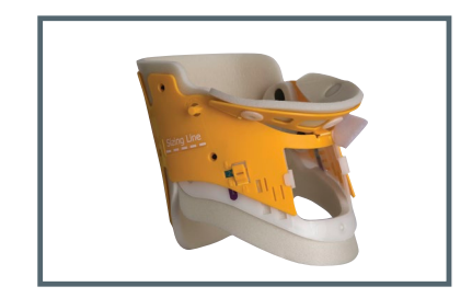
Ambu Redi-ACE Mini